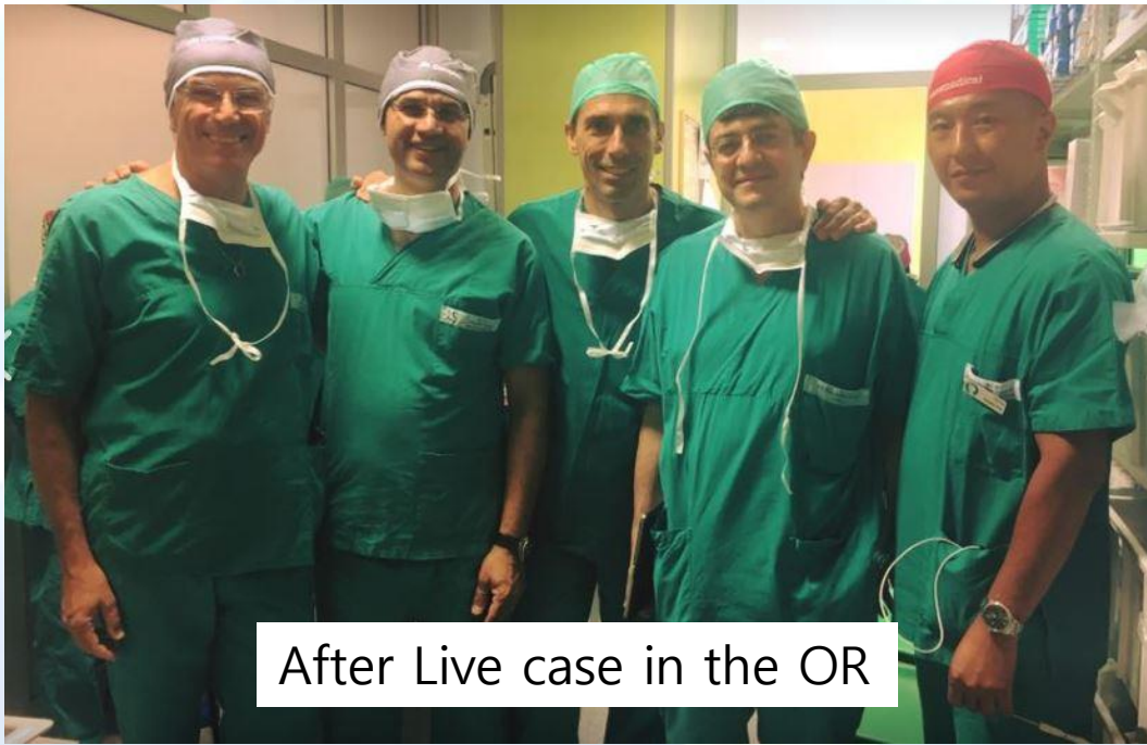
After Live case in the OR